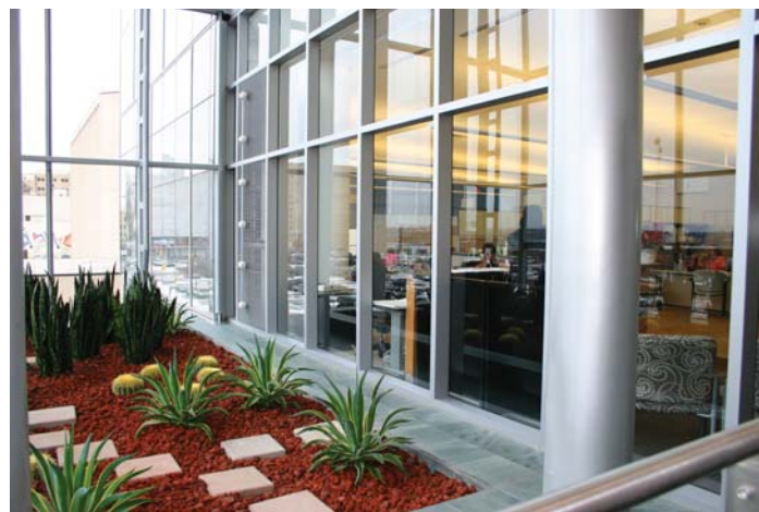
City Hall at One Technology Center 5th Floor Southeast Corner

No additional taxes on citizens were required to purchase OTC. The purchase of the building was financed through the sale of $67 million in tax-exempt revenue bonds. That amount is greater than the purchase price because of moving and modification costs were included. Financial risks were minimized by creating a revenue stream from leasing of office space in the building not needed for City government functions.