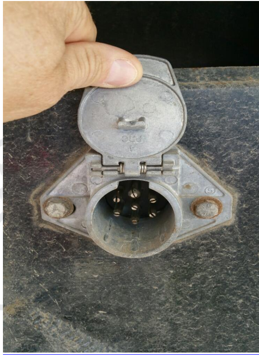
Seven way plug in