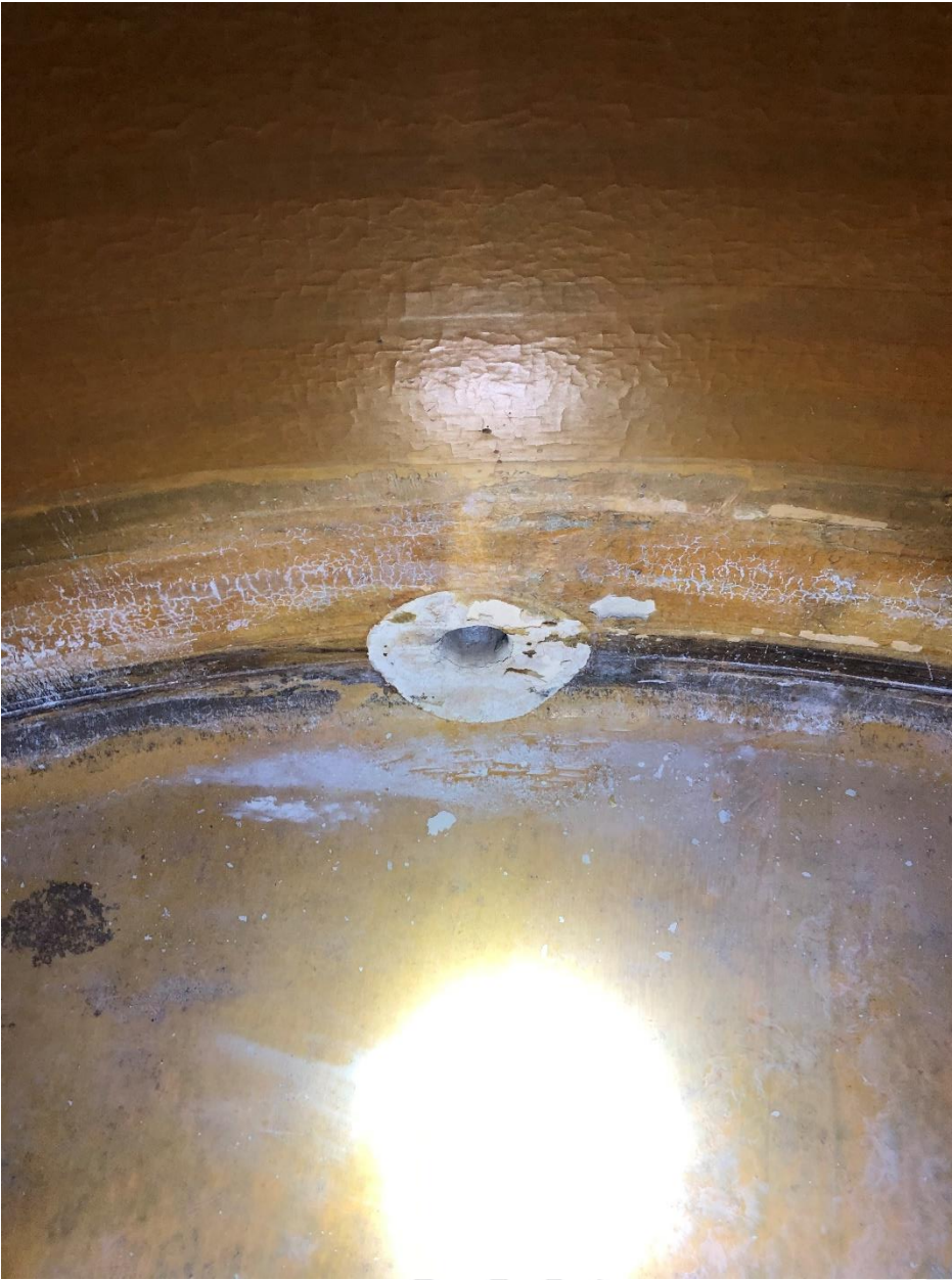
Failed Flange Inter Pic