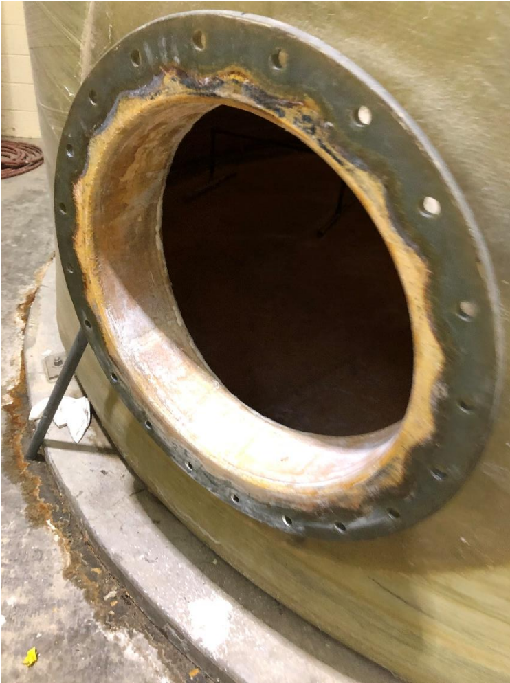
Manway 1 Pics (4)