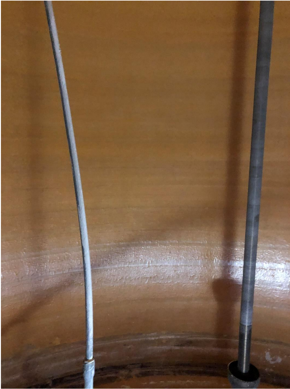
Failed liner (mud caking) pic