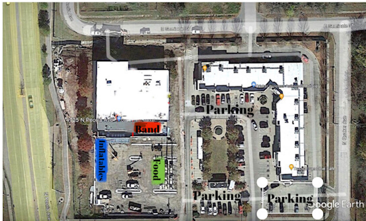
Oasis Fresh Market (1725 N. Peoria) Tulsa, OK