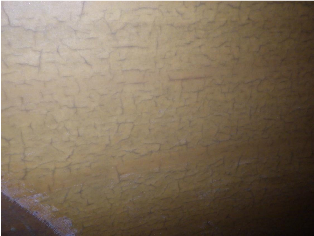
PHOTO #11 – OVERALL VIEW OF TANK 7 – T – 11 INTERIOR WALL WITH CRACK INDICATIONS