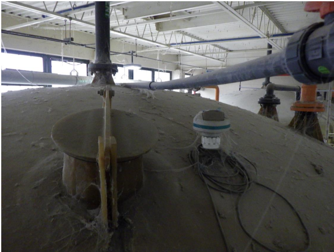
PHOTO #10 – OVERALL VIEW OF TANK ROOF, VENT AND OTHER NOZZLE PENETRATIONS