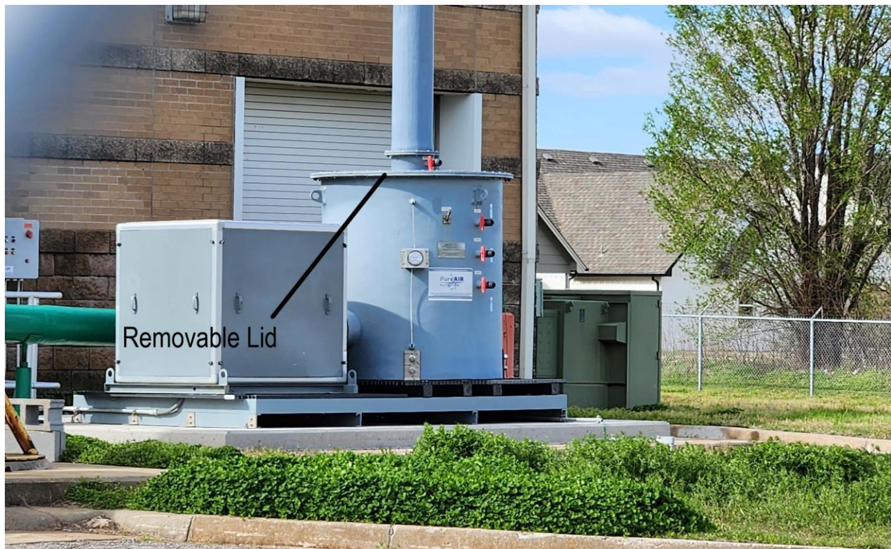
SE Lift Station