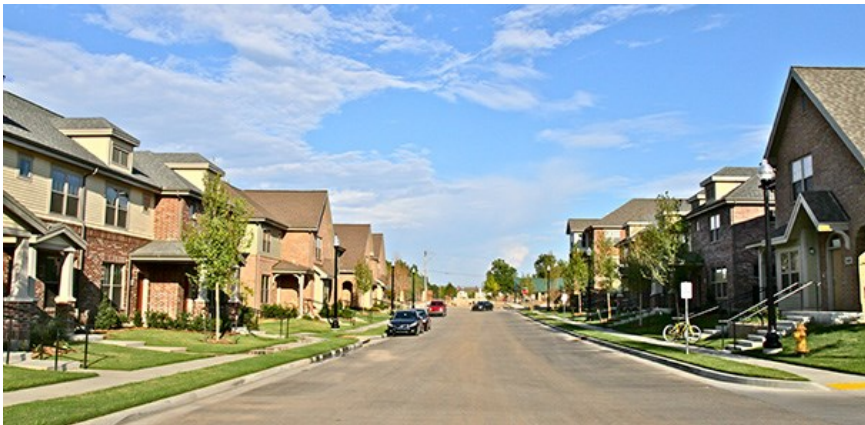
Mixed-income apartments in Tulsa's Kendall-Whittier neighborhood