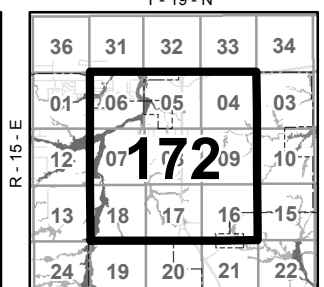
Panel Index 2