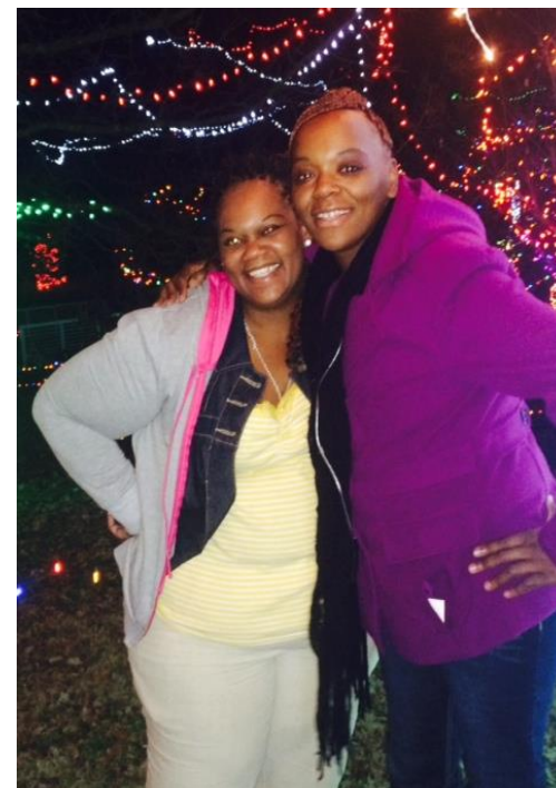
Program mentor and mentee enjoying holiday lights at Rhema.