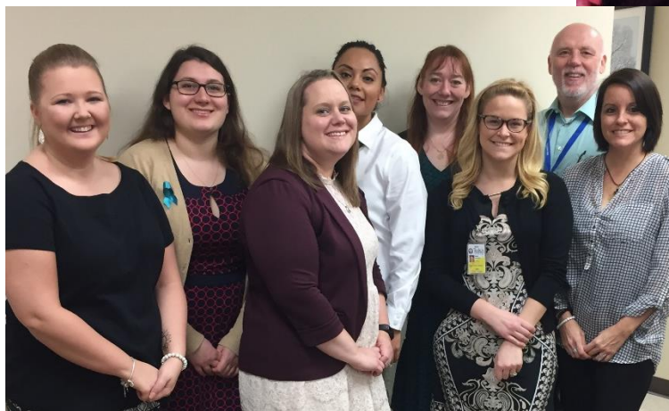
DVIS Legal Team