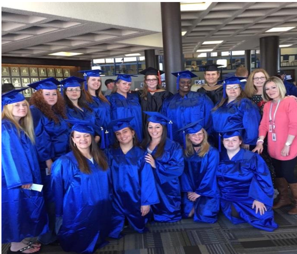
The Choosing to Change program graduates earning Tulsa Community College credits while incarcerated.