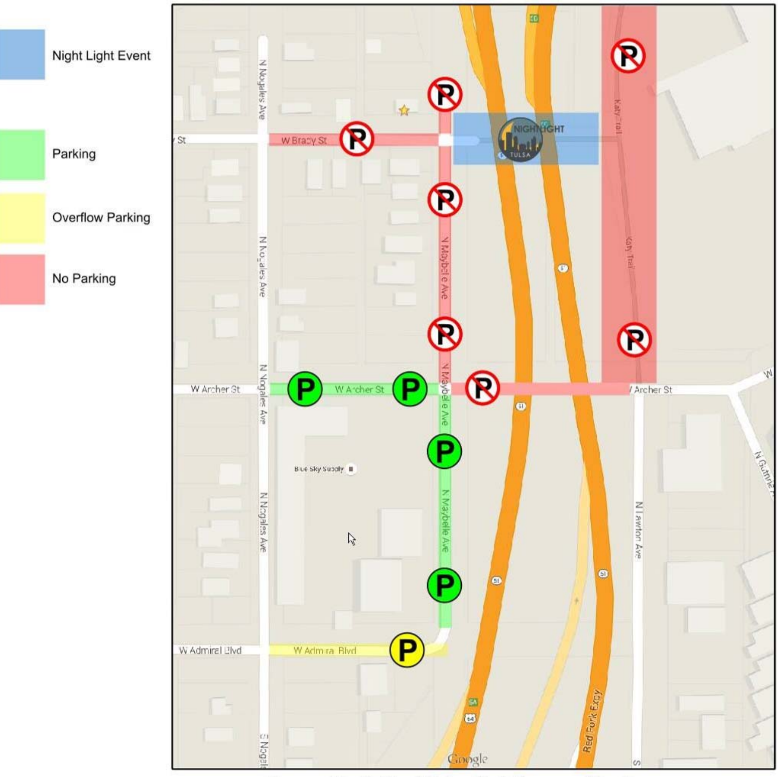
Please park legally. Do not block resident driveways or sidewalks.