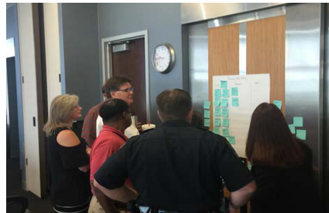
Teams working to identify what services we have to impact well-being and our role in those services.

Aug. 23, 2017 – OPSI hosted a workshop with internal staff to discuss reducing traffic fatalities.