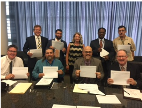
Department Leaders commit to the Strategic Plan

Jan. 2017 – Department leaders participated in workshops and identified the programs in their areas that connect to the Strategic Goal Areas.