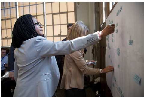
Councilors at the July Retreat identifying external agencies working on shared goals.

Jul. 12, 2017 – Mayor and City Councilors worked to identify external parties who are working to impact citywide goals.