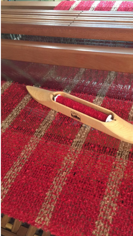
Red wool bouclé cocoon weaving in process.

“You can’t use up creativity. The more you use, the more you have.”