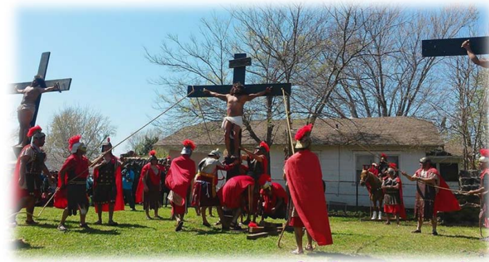
Live Passion of the Lord