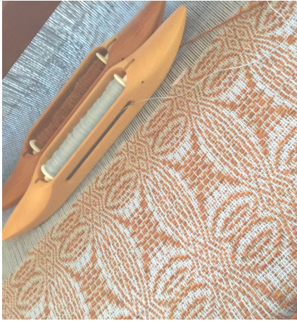
Double orange peel overshoot pattern on cotolin.

Don't forget to enroll early! Many of our classes have size and space limits, so please sign up at your earliest convenience.