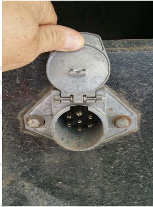
Seven way plug in