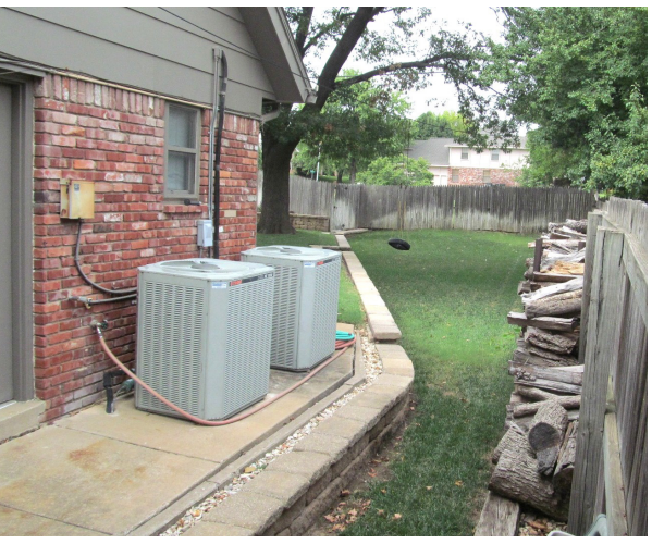
This platform and wall protect the home and air conditioning equipment from shallow flooding.

The City of Tulsa is willing to have a stormwater engineer do a site visit to assist you in analyzing your specific drainage problems and discuss potential solutions. Contact the Customer Care Center at (918) 596-7777, or go online to www.cityoftulsa.org/connect/contact-the-city.