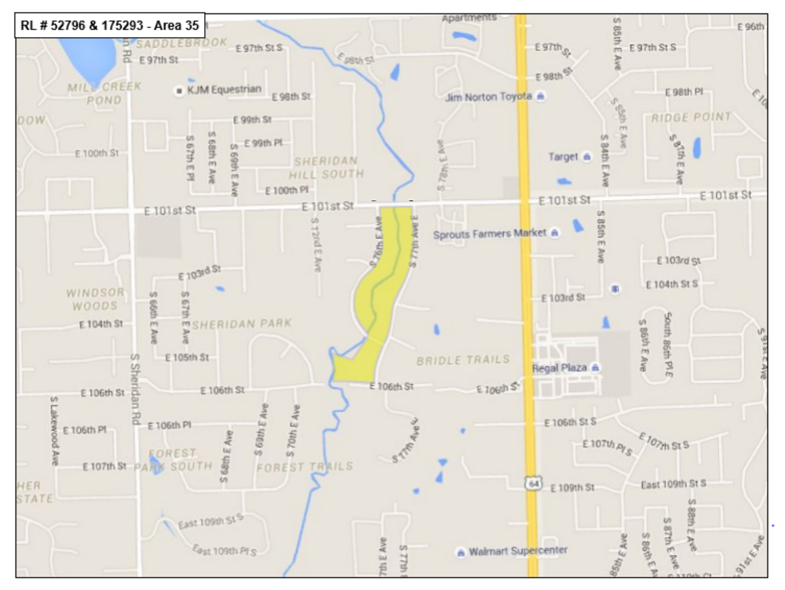
RLA #35 is situated along Fry Ditch No. 2 between E. 101<sup>st</sup> St. in the north and E. 106<sup>th</sup> St. in the south.

Class II rating in the NFIP's Community Rating System (CRS), which grants its residents a 40 percent discount on the cost of flood insurance for structures in the Special Flood Hazard Area (SFHA), also known as the 1% or 100-year floodplain. Since the Biggert-Waters Flood Insurance Reform Act of 2012, many properties have seen a substantial increase in their premiums, making this discount even more important.