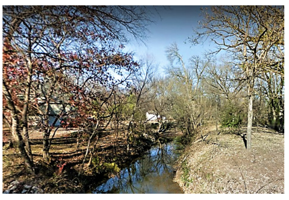
Looking north on Fry Ditch No. 2 from S. 76<sup>th</sup> E. Ave.

The 16 singlefamily residences of RLA #35 are situated along Fry Ditch No. 2 at between 650 and 660 feet elevation. All properties are within FEMA and the City's 100vear floodplains, and 11 properties are either within or touched by the creek's floodway. The 100-year floodplain through the RLA