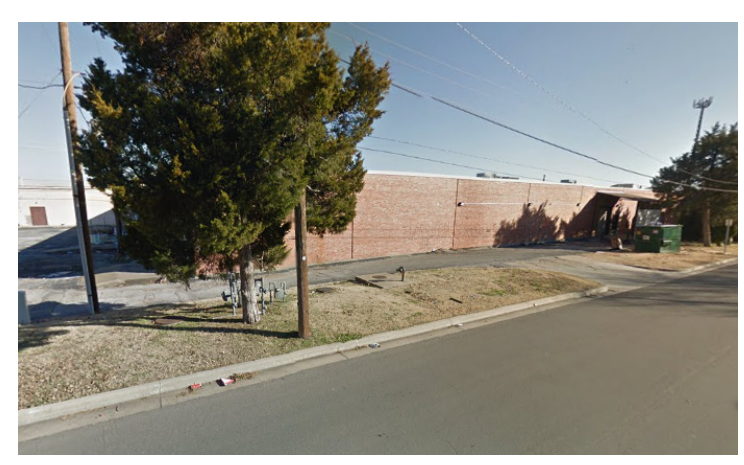
Property 1 in RLA #36 backs onto S. Maplewood Ave. and acts as a barrier to overland flow runoff coming down E. 21<sup>st</sup> Pl. and E. 22<sup>nd</sup> St. from the high ground along S. Fulton Pl.

In the late 1990s, the City of Tulsa installed additional storm sewer inlets along Maplewood Ave. at the lower ends of E. 21<sup>st</sup> Pl., E. 22<sup>nd</sup> St. and E. 22<sup>nd</sup> Pl. These improvements, along with some protective berms on the east side of Maplewood Ave., appear to have alleviated the flooding problems for the RLA, as there have been no claims since 1995.