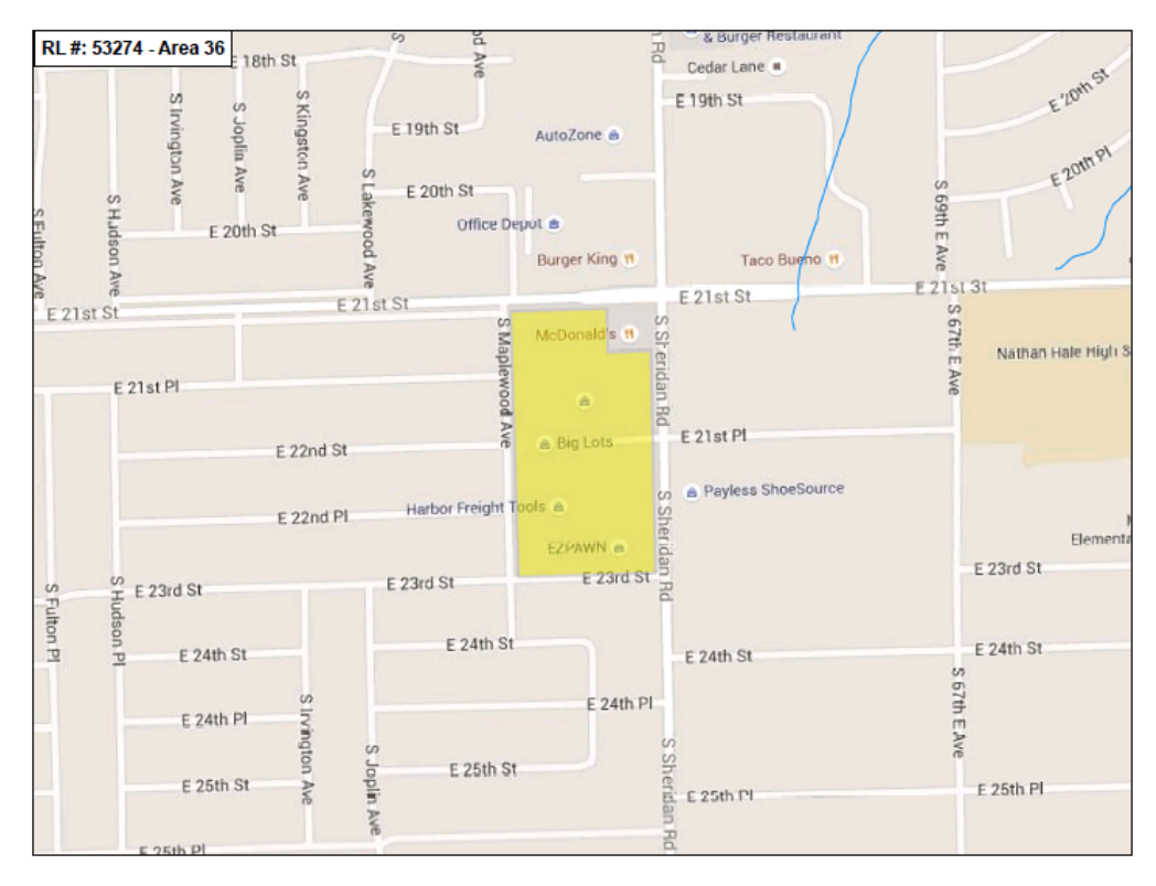
RLA #36 is located southwest of the corner of E. 21st St. and S. Sheridan Rd.

Repetitive Loss Area #36 is comprised of one property lot in the Jones Creek drainage containing five structures, all of them commercial buildings. The RLA, a shopping center, reaches from E. 21<sup>st</sup> St. and S. Sheridan Rd. in the northeast to E. 23<sup>rd</sup> St. and S. Maplewood Ave. in the southwest. In this upper reach of Jones Creek, the stream is carried in storm sewers in a northeasterly direction from its origins at about E. 25<sup>th</sup> St. and S. Joplin Ave. to E. 21<sup>st</sup> St. and S. 68<sup>th</sup> E. Ave., where it emerges briefly into an open channel. According to both FEMA's and the City of Tulsa's flood hazard maps, none of the structures in RLA #36 is within or touched by Jones Creek's 100-year floodplain, which is between 300 and 500 ft. east of Sheridan Rd. There is one repetitive loss property in the RLA, which made claims in 1984 and 1995 for a total of $5,827. Flood damage has been due to inadequate storm sewer capacity and overland flow down E. 21<sup>st</sup> Pl. and E. 22<sup>nd</sup> St. from the high ground along S. Hudson Pl. Runoff converges at S. Maplewood Ave., on the west side of RLA #36, where the western-most building in the shopping center acts as an impediment to further flow and the storm sewers are often overwhelmed. There have been no flood claims in the RLA since 1995.