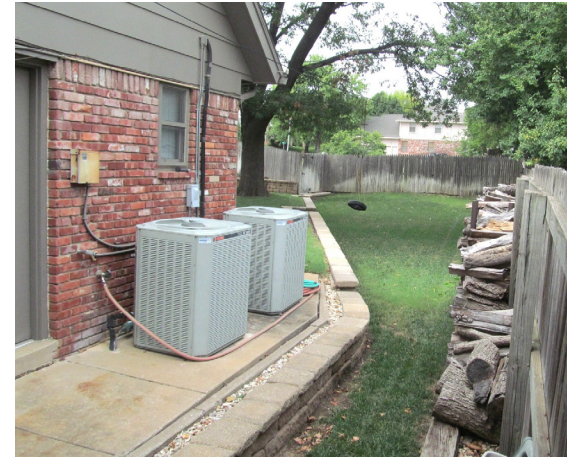
This platform and wall protect the home and air conditioning equipment from shallow flooding.

Create Berms, Swales or Redirected Drainage: Flood waters can be diverted away from structures using berms, brick