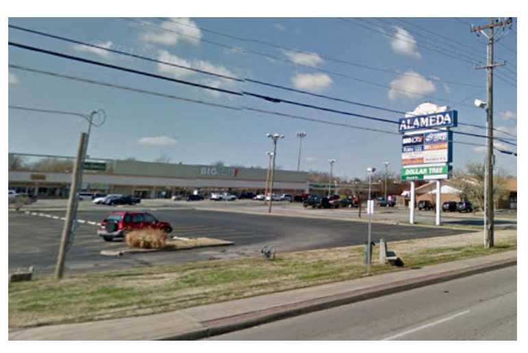
RLA #36 is located in the Jones Creek drainage, immediately southwest of the intersection of E. 21<sup>st</sup> St. and S. Sheridan Rd.

Jones Creek is a 4-mile-long, left-bank tributary to Mingo Creek that drains about 2 square miles of east Tulsa. The creek rises in the high ground near E. 25<sup>th</sup> St. and Joplin Ave. and flows generally eastnortheast through residential, commercial and industrial neighborhoods to join Mill Creek at about E. 12<sup>th</sup> St. and 87<sup>th</sup> E. Ave. En route, the mainstem is joined by a northern, left bank tributary (Mingo LB7-2 L) just west of Memorial Blvd. and by a right