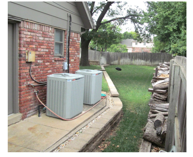
This platform and wall protect the home and air conditioning equipment from shallow flooding.

and property owners in flood hazard areas know and understand their flood risk and take what steps they can to protect their homes, families and possessions. City staff is available to explain the local flood risk, interpret floodplain maps, and determine if an area or property has drainage problems or a history of prior flooding. Staff can also discuss the ways a specific property can be protected from flooding. An Elevation Certificate can help define a property's flood risk under various rainfall scenarios (e.g., in a 10-year, 50year, 100-year, or 300-year storm). You can receive a free flood zone determination by contacting the City