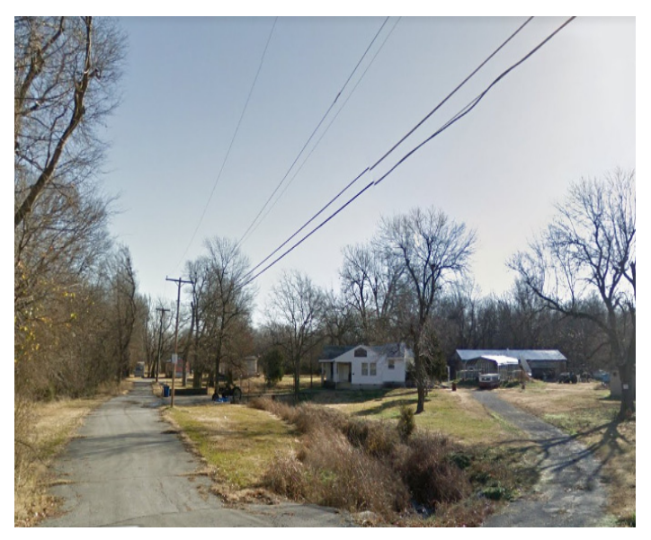
The properties of RLA #37 all lie within the 100-year floodplain of Flat Rock Creek.

The six properties of RLA #37 are situated in the lower Flat Rock Creek drainage along W. 49<sup>th</sup> St. N. and W. 51<sup>st</sup> St. N., west of Lake Yahola and U.S. Hwy 75. The terrain of the RLA is flat floodplain with no storm sewers and only shallow bar ditches for drainage. The properties lie within the 100-year floodplain of Flat Rock Creek at an elevation of between 595 and 604 feet. The SFHA in this area reaches to the