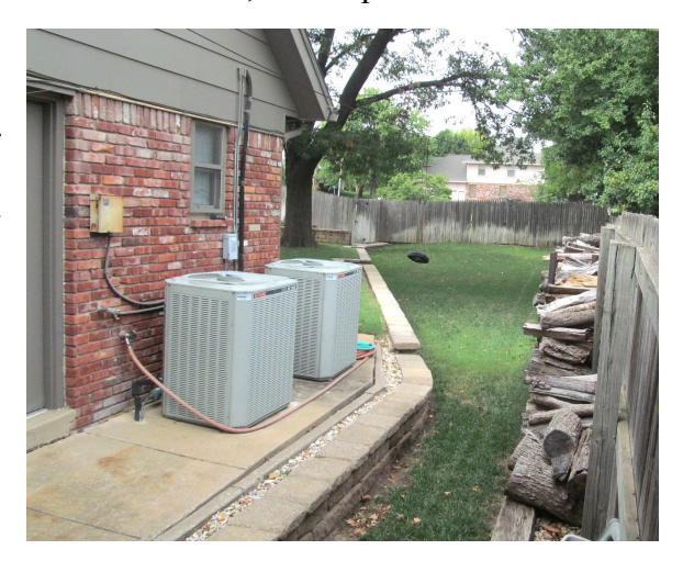
This platform and wall protect the home and air conditioning equipment from shallow flooding.

and property owners in flood hazard areas know and understand their flood risk and take what steps they can to protect their homes, families and possessions. City staff is available to explain the local flood risk, interpret floodplain maps, and determine if an area or property has drainage problems or a history of prior flooding. Staff can also discuss the ways a specific property can be protected from flooding. An Elevation Certificate can help define a property's flood risk under various rainfall scenarios (e.g., in a 10-year, 50-year, 100year, or 300-year storm). You can receive a free flood zone determination by contacting the City with the correct legal