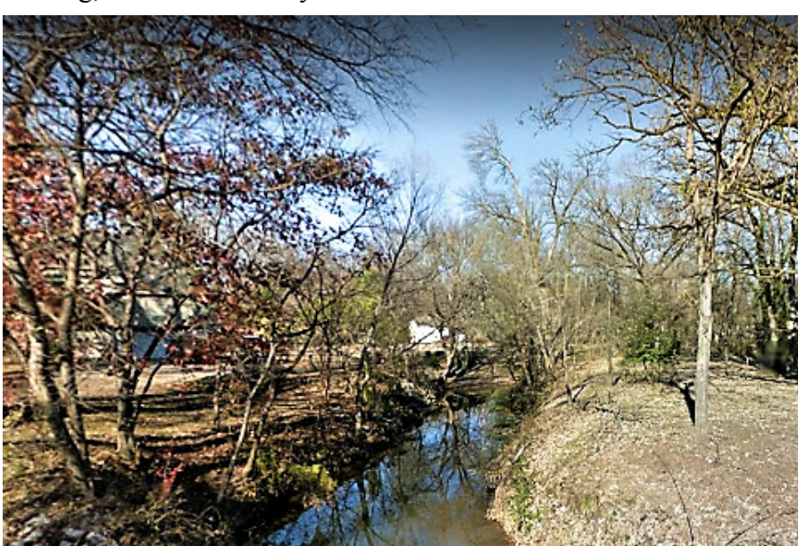
Looking north on Fry Ditch No. 2 from S. 76<sup>th</sup> E. Ave.

The six single-family residences of RLA #58 are situated along Fry