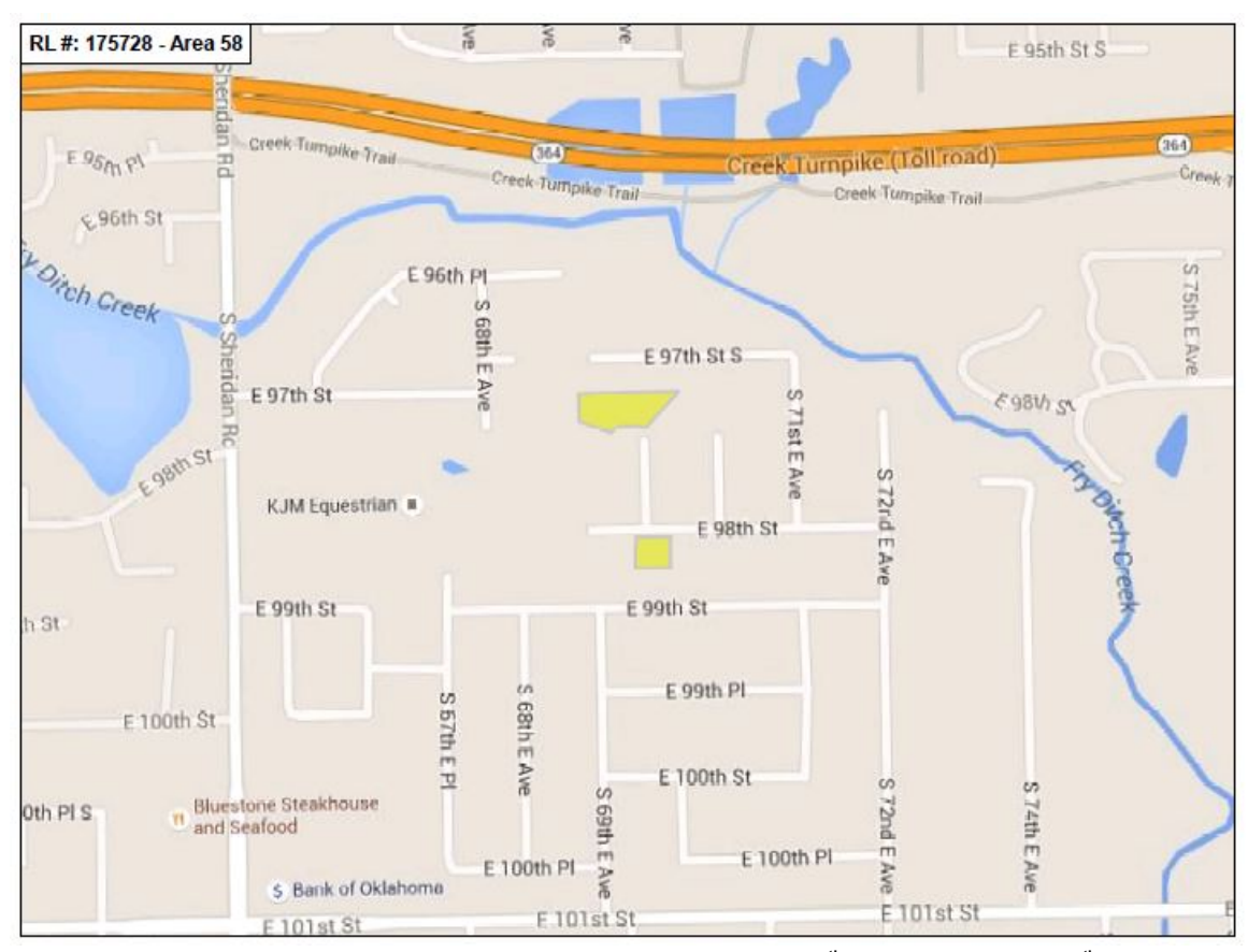
RLA #58 is situated in the Fry Ditch No. 2 drainage between S. 69<sup>th</sup> E. Ave. between E. 97<sup>th</sup> St. and E. 98<sup>th</sup> St.

Tulsa joined the NFIP in 1974, and through great effort and considerable expense has significantly reduced its exposure to flooding. As a result, Tulsa has been awarded a Class II rating in the NFIP's Community Rating System (CRS), which grants its residents a 40 percent discount on the cost of flood insurance for structures in the Special Flood Hazard Area (SFHA), also known as the 1% or 100-year floodplain. Since the Biggert-Waters Flood Insurance Reform Act of 2012, many properties have seen a substantial increase in their premiums, making this discount even more important.