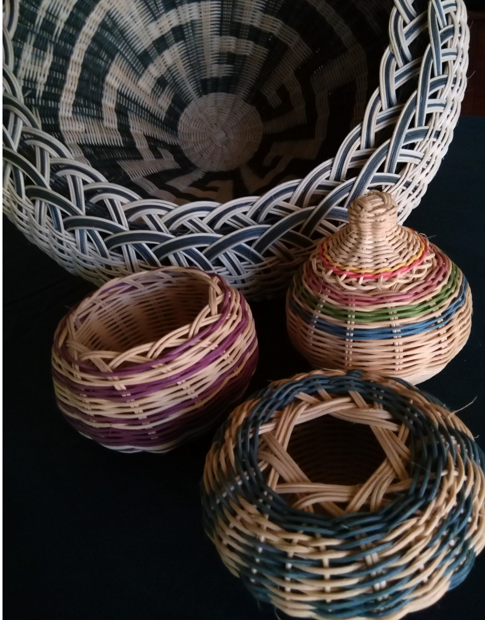
Baskets woven by Laura Borders, see pg. 13 for Beginning Basket Weaving.

Our Instructors, page 2 Mark Your Calendars, page 3 Special Events & Workshops, page 4 Facility Rentals, page 5